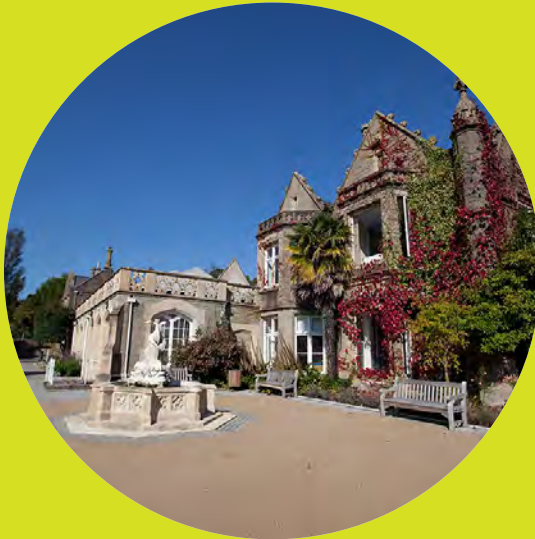
Singleton Park Campus